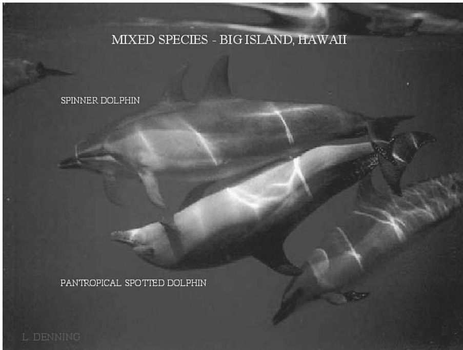
Figure 2. Interspecific copulation between a pantropical spotted dolphin, Stenella attenuata , (bottom) and a spinner dolphin, Stenella longirostris , (top) off the island of Hawaii.

(3) On 5 August 1997, between 0645 and 0945 h, a group of 40–50 spinner dolphins and 25–30 spotted dolphins were observed. The spinner dolphins were spread out in small subgroups, but the spotted dolphins were in a single loose, but contained, group. A subgroup of nine adult spinner dolphins and one spinner dolphin calf was 5 m from the spotted dolphins. The calf was swimming in a close triad with her mother and another adult female. This female was observed leaving the mother/calf pair, swimming up to a spotted dolphin, tussling with and biting the spotted dolphin, then returning to the mother/calf. The interaction was not overly long or aggressive. No other spinner dolphins were seen engaged in interactions with the spotted dolphins.