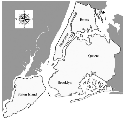
Figure 1. Locations of field sites in New York City between 2011 and 2017: (1) Orchard Beach (◆) and (2) Hoffman (north) and Swinburne (south) Islands (×)

The boat-based observations were conducted in conjunction with the New York City Audubon Society, which runs boat tours from January through March each year; thus, the observation