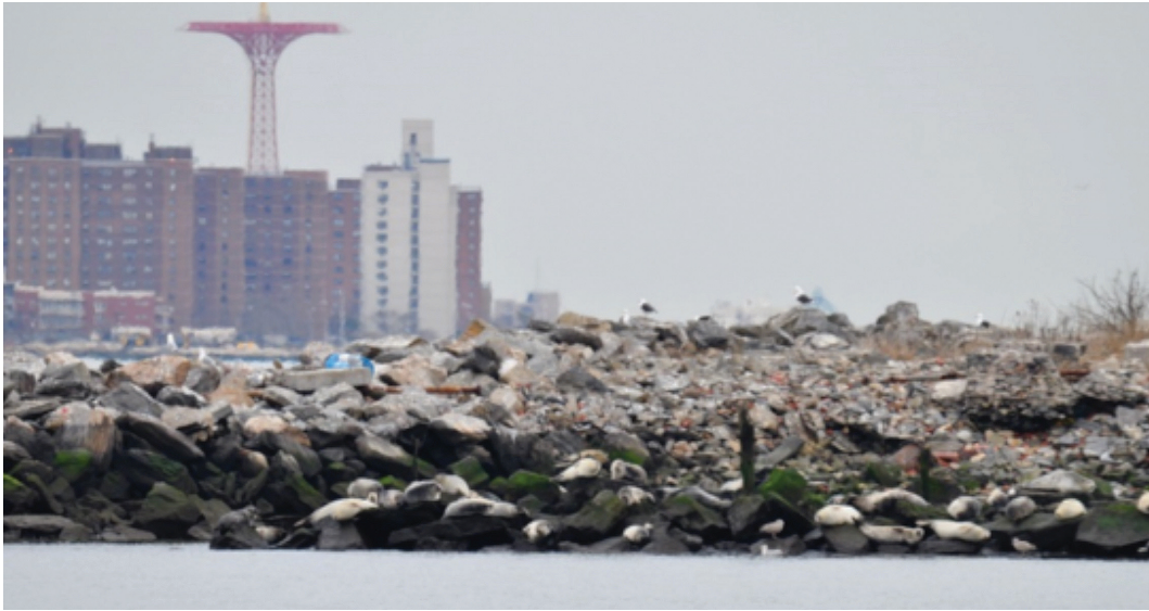
Figure 2. Photograph of pinnipeds hauled out on Swinburne Island with the urban landscape of Coney Island, Brooklyn, in the background

with an iPhone 5 (Apple Inc., Cupertino, CA, USA) and/or Samsung Galaxy S4 (Samsung Electronics Co., Suwon, South Korea) for digi-scoping, and (2) a Nikon D5000 digital single lens reflex camera (12.3 MP; Nikon USA, Melville, NY, USA) with a Tamron SP A011 150-600 mm telephoto lens (Tamron USA, Inc., Commack, NY, USA). For each observation period, photographs (.jpgs) of our field sites were captured, and downloaded onto an Apple Mac-Mini (3.0 GHz dual-core Intel Core i7 processor; Apple Inc.). With the use of both digital systems, panoramic photographs of our field sites were taken to more accurately count the number of individuals upon subsequent review (see Figure 2).