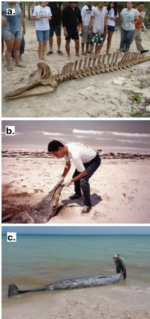
Figure 2. (a) Cuvier's beaked whale ( Ziphius cavirostris ) in Mahahual, Quintana Roo, México, in 2011; (b) Blainville's beaked whale ( Mesoplodon densirostris ) in Sisal, Yucatán, México, in 1999; and (c) Gervais' beaked whale ( Mesoplodon europaeus ) in Las Coloradas, Yucatán, México, in 2015.

in five different Mexican states (Veracruz, Tabasco, Campeche, Yucatán, and Quintana Roo) (Figure 2c). These records date from 1986 to 2022, with 1986 the first for the species in México and the Mexican Gulf of Mexico and 2010 for the Mexican Caribbean Sea. Würsig et al. (2000) reported 11 strandings of this species in the U.S. Gulf of Mexico and four in northwestern Cuba.